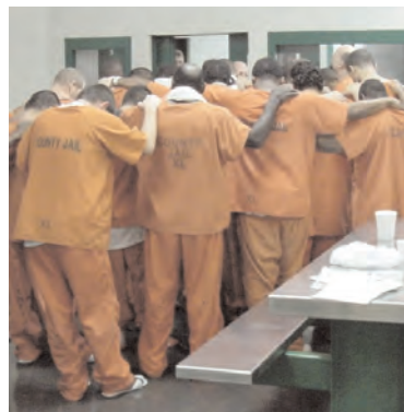
Inmates joining in prayer

It is important to maintain the ministry behind these fences, to reach our fellow Catholics. In the position that we are in, we can reach many that have gone astray and need direction. I know that I have come extremely far in my own walk and have a strong testimony that many can relate to. I know that if I could change within these walls with the help of Jesus Christ, they can as well. Ministry is happening in a place that seems cut off and almost forgotten by society. However, it is with the help of outside organizations like Dismas Ministry that makes a lot of ministry possible. Without their support many of us would not have those essential tools that we depend upon. I pray the peace and love of our Lord be with you now and forever.