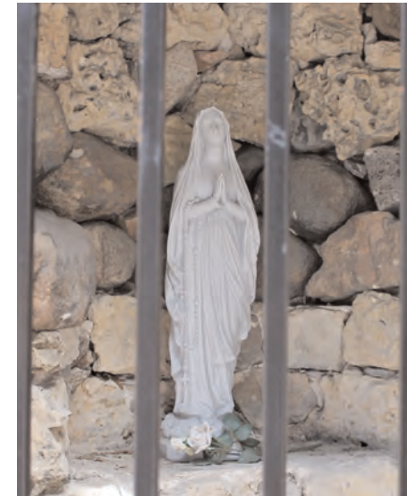
Mary, mother of all prisoners, pray for us.