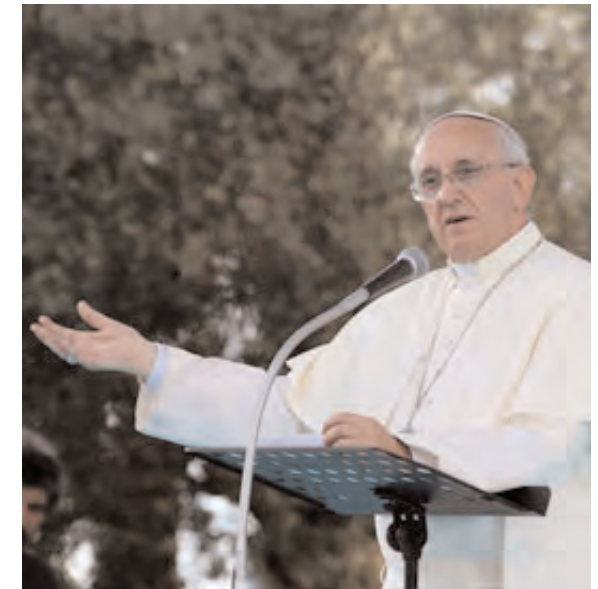
Pope Francis speaking to prison chaplains

When Pope Francis met with and welcomed the members of the National Convention of Italian Prison Chaplains, he highlighted their work in showing God's mercy and providing hope to people who need it most.