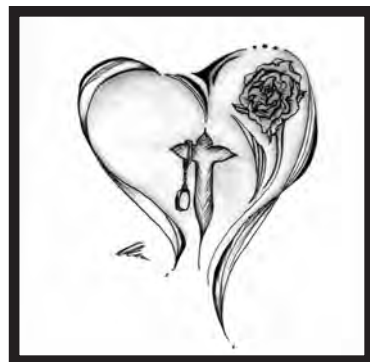
Artwork by an Inmate

Additionally, new rules allow for "expedited removal" of those seeking asylum—a process whereby INS officials turn away those fleeing persecution in their home countries. Those not quickly returned are placed in detention centers for weeks or even months until they receive an asylum hearing. (To be continued)