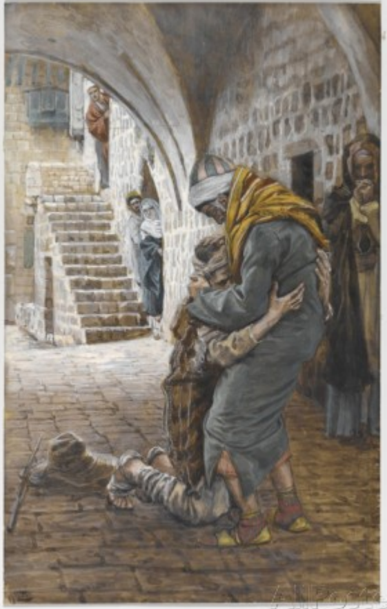
The name of God is mercy. - Pope Francis

November 10-11, 2016 Archbishop Cousins Catholic Center 3501 South Lake Drive, Milwaukee, Wisconsin